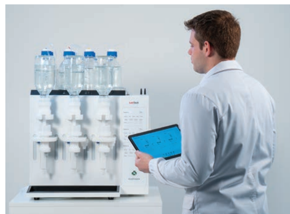
Easy access and intuitive control for enhanced operator efficiency.