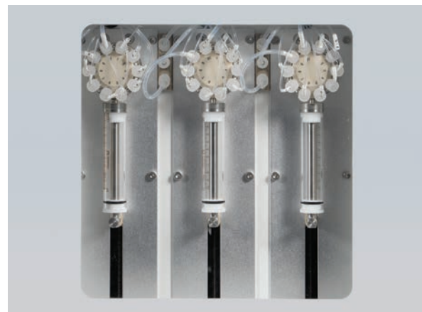
Integrated syringe pump system for a precise and independent control.